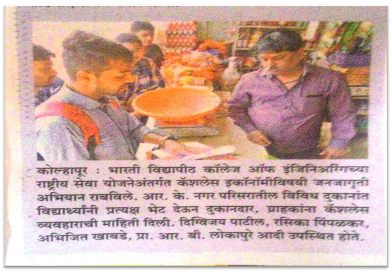
News In local Newspaper, 'Daily Sakal'' Dt.-14 March 2018.